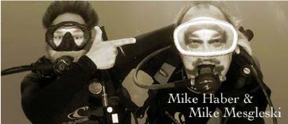
Jim Church School on Utila Aggressor October 13 – 20, 2007

Closing out our 2007 season, the Jim Church School of Digital UW Photography headed to the Bay Islands of Honduras for a week aboard the Utila Aggressor. This was our first trip to Utila, but it certainly will not be our last!