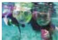
2006 Family Charter Dates