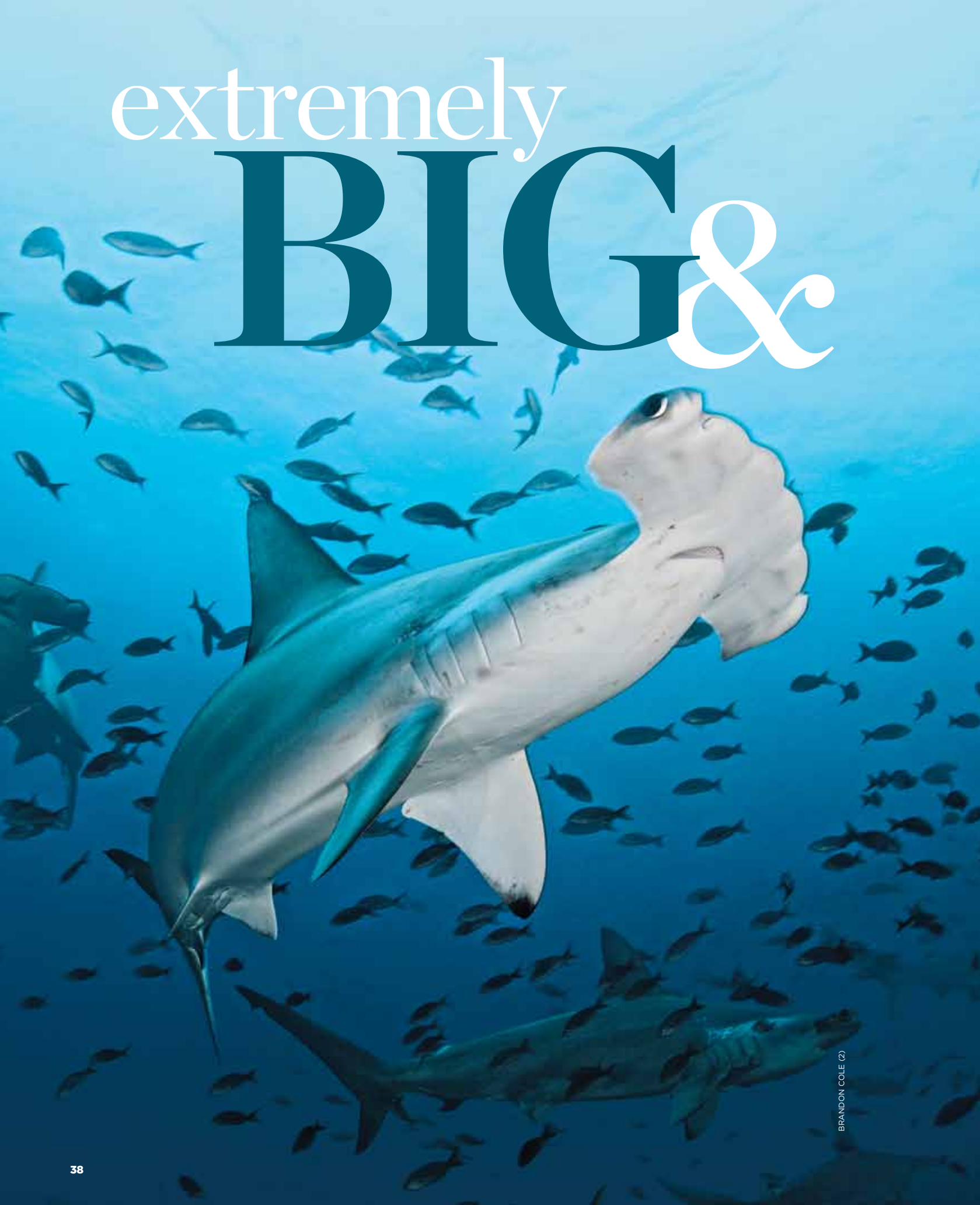
BRANDON COLE (2)