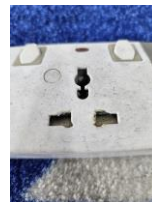
Universal Multi- configuration Socket